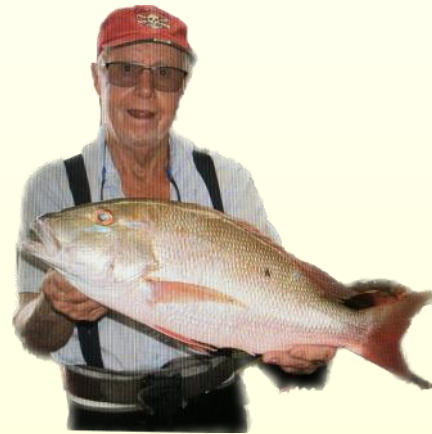
Click the mutton to go to Tournament Catch photos

"PERHAPS I SHOULD HAVE NOT BEEN A FISHERMAN, HE THOUGHT. BUT THAT WAS THE THING THAT I WAS BORN FOR"