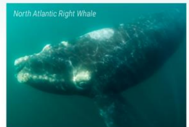
North Atlantic Right Whale

All of the great whales have very long, slow life cycles so losing any number of whales quickly is dangerous for the populations. North Atlantic Right Whales in particular still have not successfully recovered from the days of whaling. As a result, losing 17 right whales in a quick period of time is cause for declaring a UME to find out what is happening. For the right whales, the culprit was vessel strikes combined with entanglement in ropes. The humpback whales were suffering from vessel strikes as well. The more recent minke whale strandings are also suspected to be related to entanglement in marine debris, although several of the whales also had signs of an infectious disease.