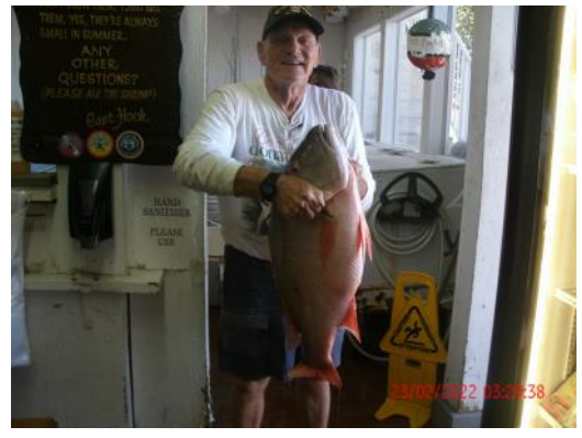
MINUTES Friday, February 4th, 2022

The February meeting of the Fishing & Boating Club was called to order on February 4th at 4:30 pm at the Public Works facility, with the Pledge of Allegiance. A moment of silence was observed to honor club members who we have lost. Past Commodores and veterans were recognized as well as charter members who were in at-