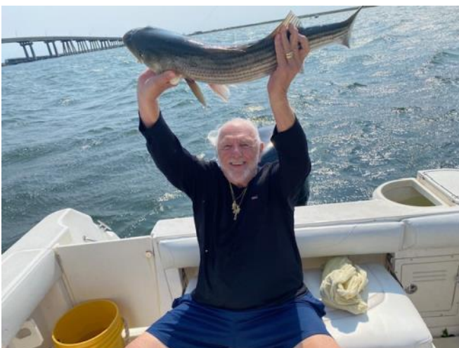
The Fruhmorgens Striper fishing the Hamptons