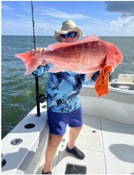
The Caseys were busy this summer! Nice fish!